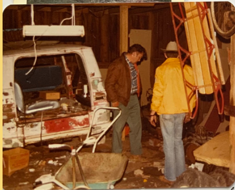
LOTS OF PARTS IN THE BARN!