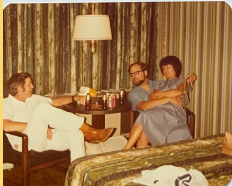
Cooling off @ AC Room @ ATLANTA CORSA NATL