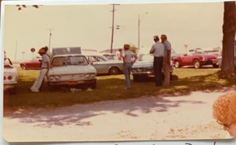
ANNUAL Spring Swap Meet @ Dick's PROBABLY 1977?