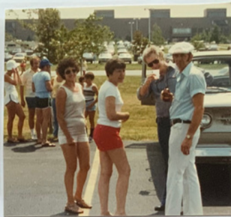
@ CORSA NATL, Detroit, '79